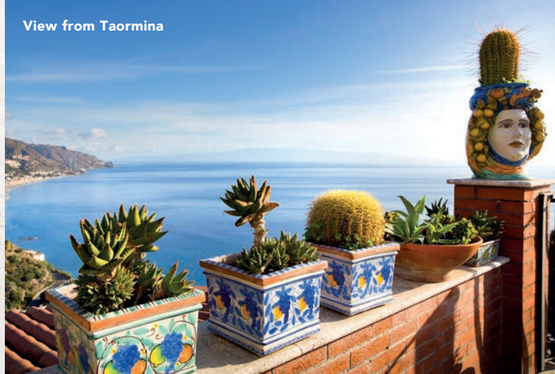
View from Taormina

STROLL in Taormina, a romantic hilltop town laden with shops and art galleries, and tour an ancient Greek theater still used for plays and concerts