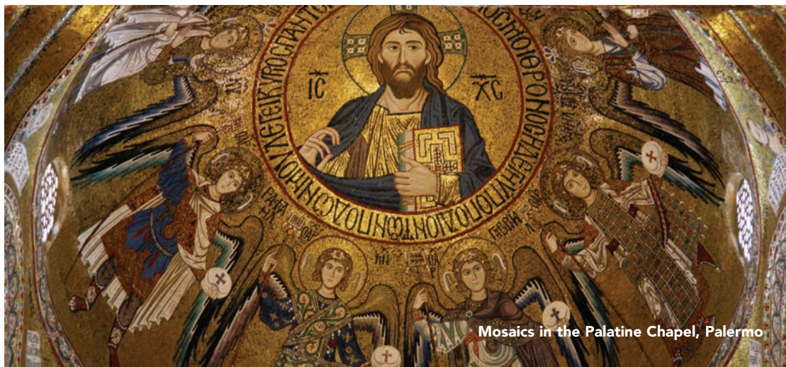
Mosaics in the Palatine Chapel, Palermo

Experience the thrill of sailing aboard Sea Cloud II , attending lectures, and delighting in the grace and romance of a bygone era of travel. B,L,D