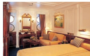
Owner's suite (top) and a Deluxe cabin (above)

S ea Cloud II is a three-masted sailing yacht steeped in the elegance of yesteryear and complemented with the most modern amenities. Sister ship of the legendary Sea Cloud , Sea Cloud II has 47 outside cabins and travels under 23 billowing sails trimmed by hand. From the mahogany-paneled library and gracious lounge to the fitness area and watersports platform, no detail has been overlooked. Praised by the world's most discerning travelers, Sea Cloud II receives consistent high rankings from Condé Nast Traveler . Passengers enjoy open seating at all meals and complimentary use of all water sports equipment. A doctor is on call 24 hours a day. ■