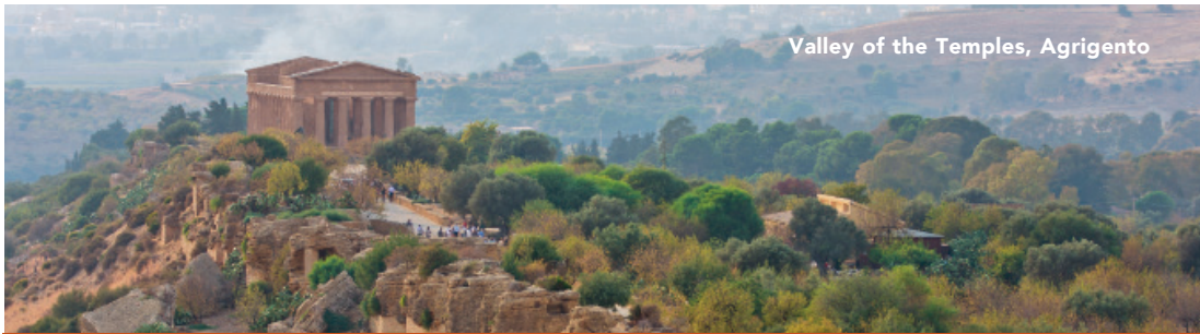
Valley of the Temples, Agrigento