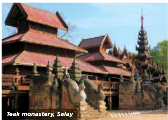
Teak monastery, Salay