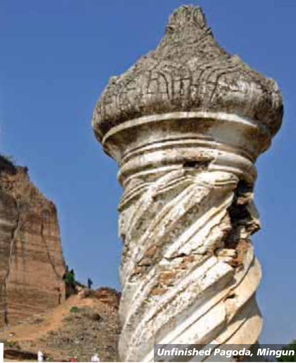
Unfinished Pagoda, Mingun