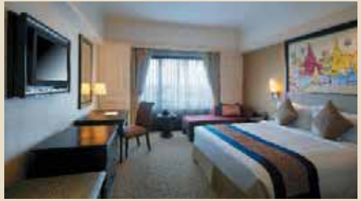
SULE SHANGRI-LA YANGON

Our travel experts have selected these luxury properties, each in a prime location, for your comfort. Details in the design and décor celebrate the local culture and enhance the ambience of each hotel. Their restaurants feature menus of elegantly prepared local and international cuisine. Of utmost importance is the superior quality of the services, amenities and accommodations, allowing you to maximize the enjoyment of your stay.