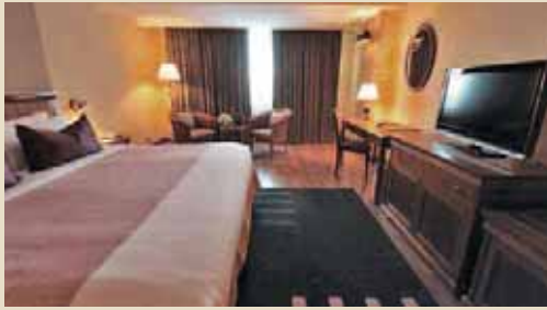
MANDALAY HILL RESORT & SPA MANDALAY