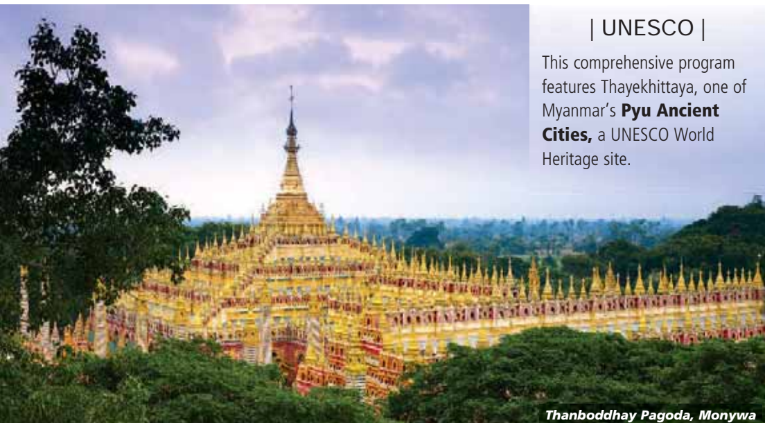
Thanboddhay Pagoda, Monywa

This comprehensive program features Thayekhittaya, one of Myanmar's Pyu Ancient Cities , a UNESCO World Heritage site.