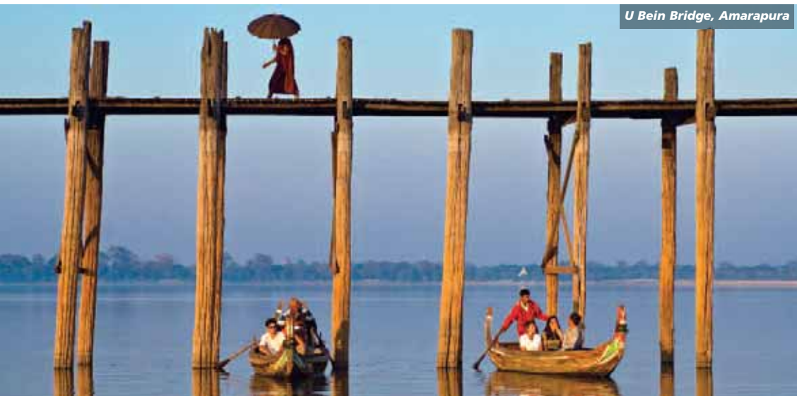
U Bein Bridge, Amarapura