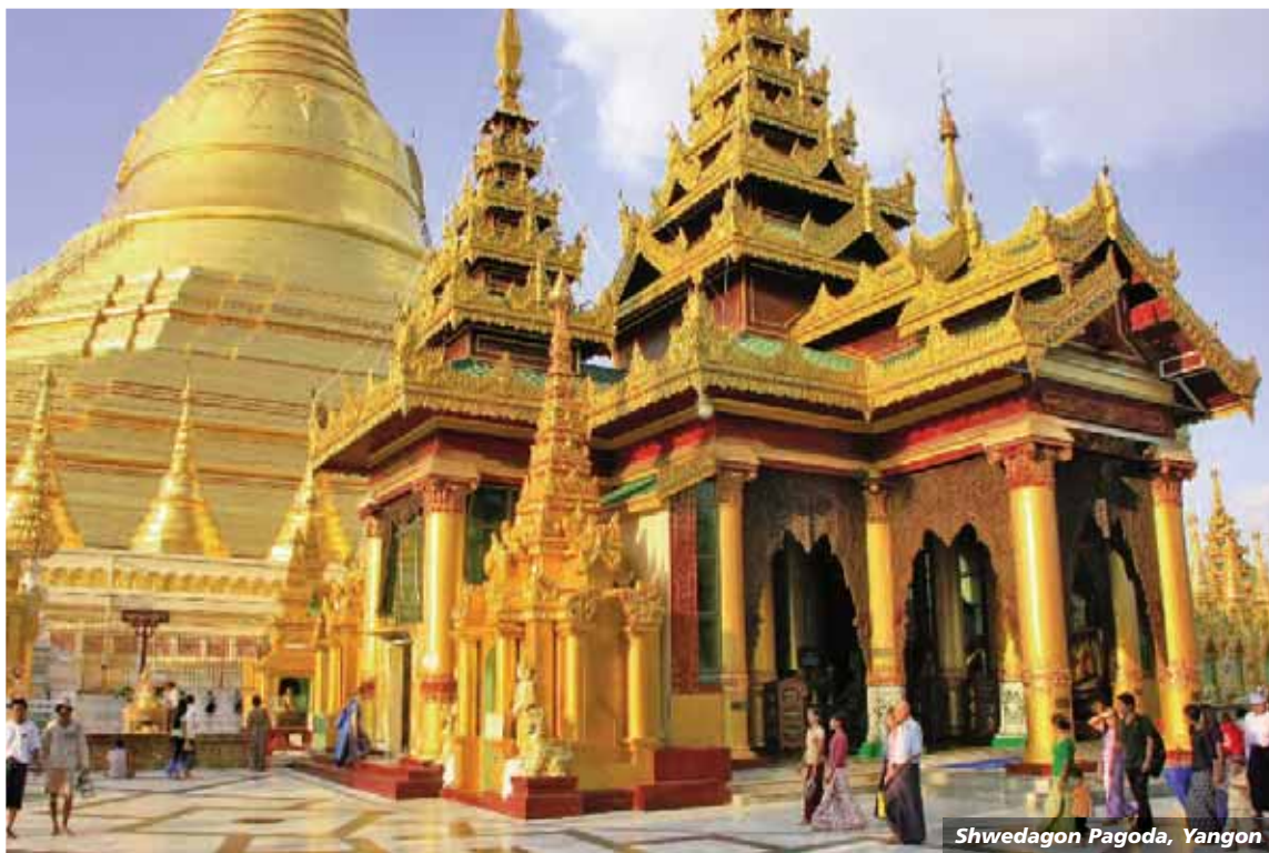
Shwedagon Pagoda, Yangon

D iscover Myanmar's reservoir of fascinating traditions, cultural gems and friendly locals. Begin in Mandalay, and journey into the heart of the Golden Land past gilded pagodas, crumbling stupas and majestic monasteries. Onboard the Irrawaddy Explorer, discover the tranquil pace of life along the Irrawaddy River; enjoy excursions to traditional villages; and travel like a local via horse cart, oxcart and trishaw. Marvel at Bagan's treasured landscape, and learn how Buddhism is imbedded in Myanmar's culture and history. Experience Myanmar as few are able, and allow it to leave a special imprint on your heart.