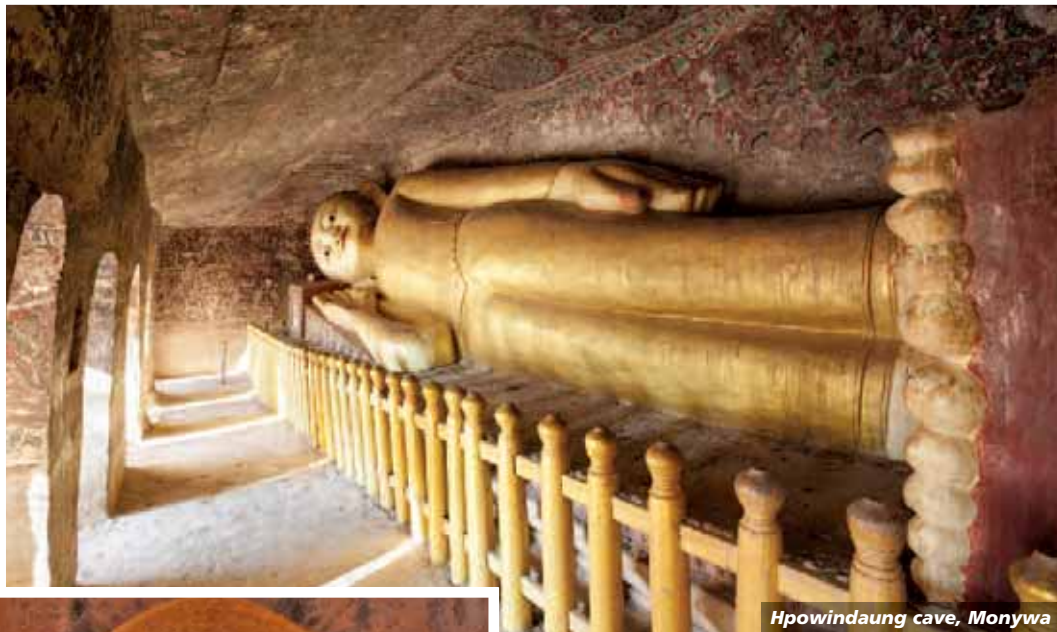
Hpowindaung cave, Monywa