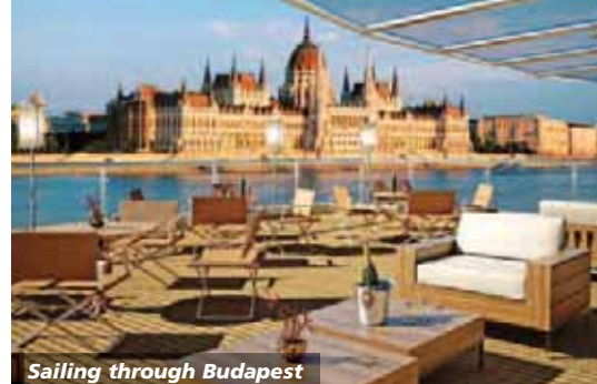
Sailing through Budapest