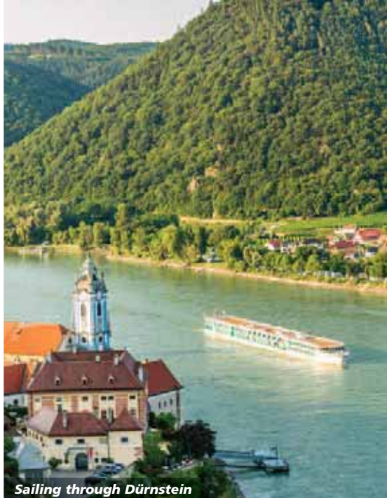
Sailing through Dürnstein