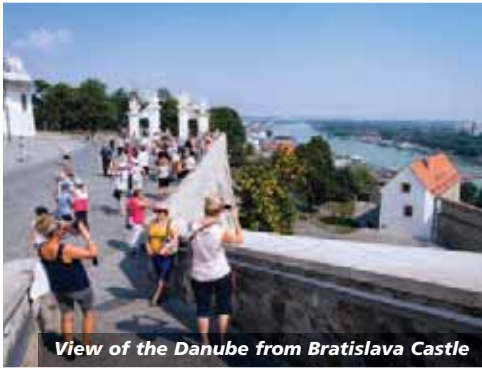
View of the Danube from Bratislava Castle