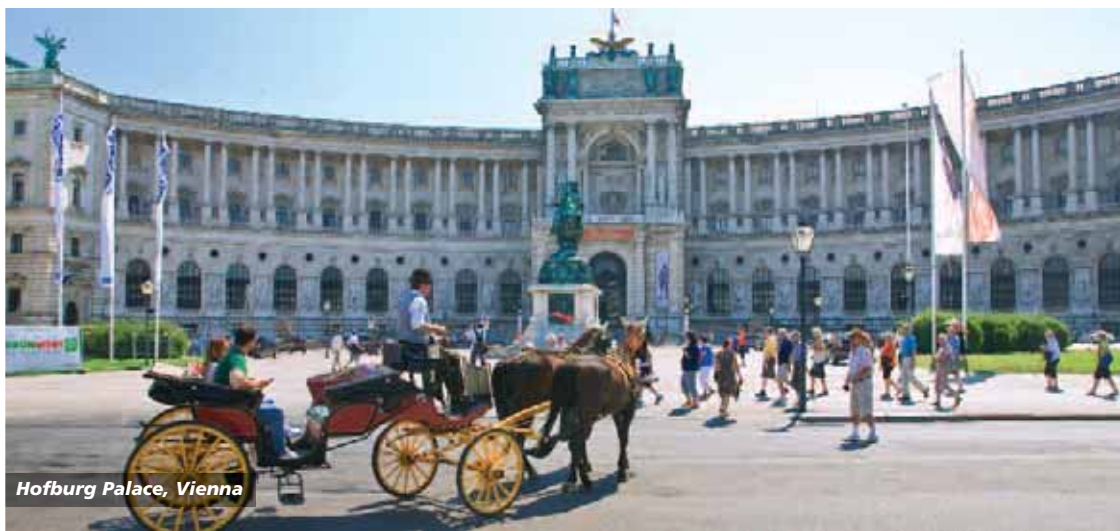
Hofburg Palace, Vienna