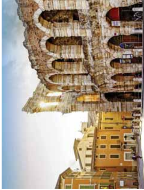
Verona Arena, Piazza Bra