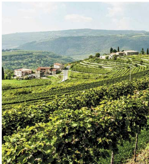
Below: Valpolicella wine region