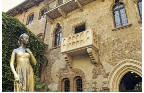
Above: Piazza Bra, Verona | Inset: Juliet's Balcony, Verona

beauty of Italy's largest lake has long inspired poets and writers. Appreciate its allure as you travel to glamorous Sirmione, a resort town on a narrow peninsula at the lake's southern end, known for its ruins of a Roman villa and Rocca Scaligera, a 13th-century castle. Cruise across the shimmering water to picturesque Lazise.