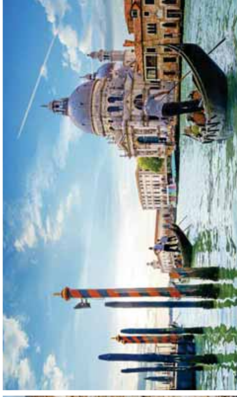
The Grand Canal, Venice