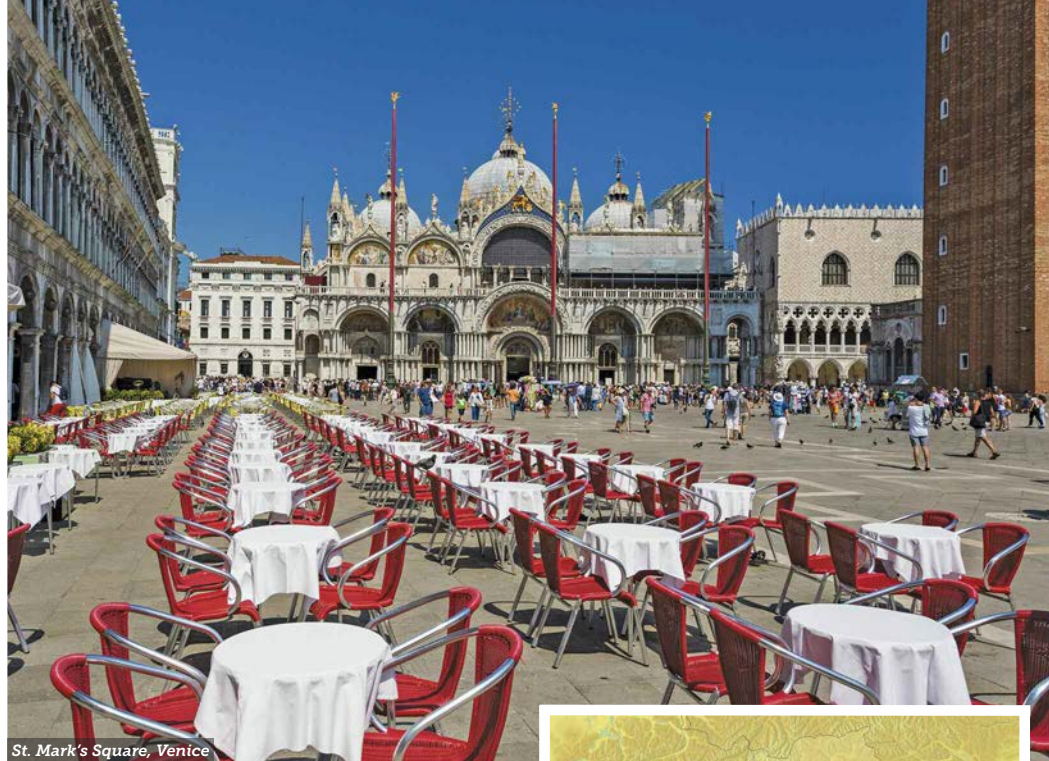
St. Mark's Square, Venice

arcades and cafés, and gaze up at the stately Campanile bell tower and the elaborate St. Mark's Clock Tower. Admire the Byzantine façade of St. Mark's Basilica and tour its glittering, mosaic-covered interior. Visit the lavish Doge's Palace, the political heart of the once mighty Venetian Republic.