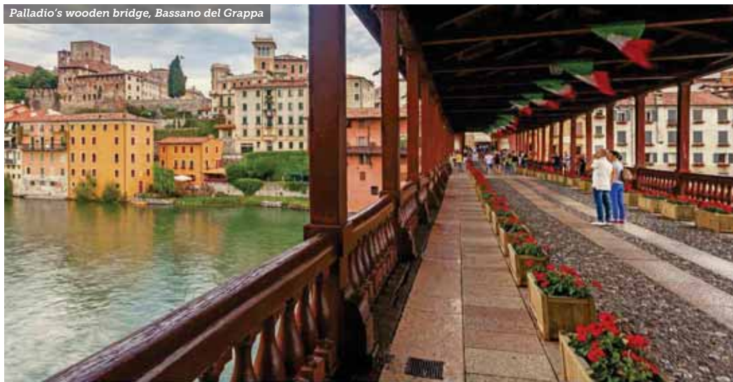
Palladio’s wooden bridge, Bassano del Grappa