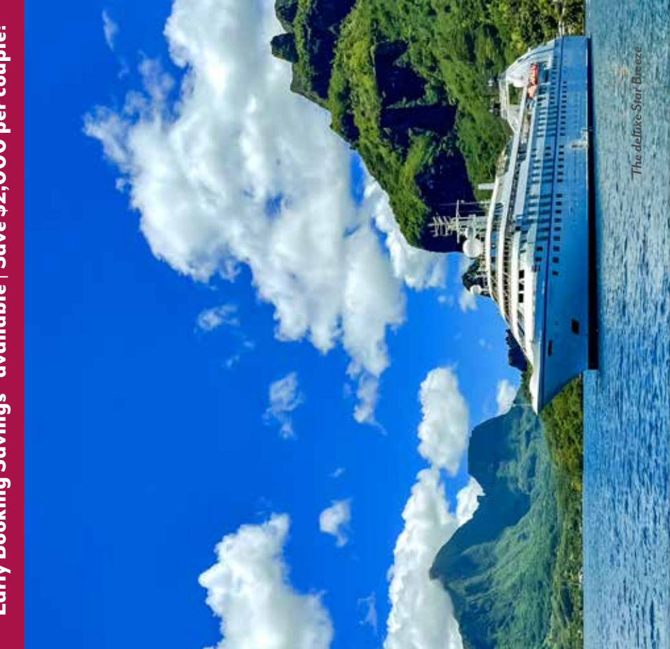
The deluxe Star Breeze

Early Booking Savings* available | Save $2,000 per couple!