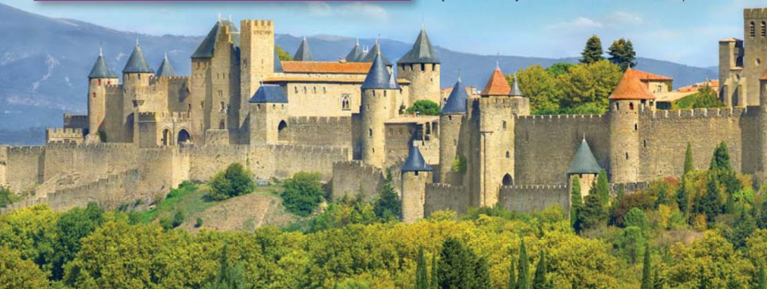
Photo this page: A fairy-tale image of towers and drawbridges, the medieval town of Carcassonne is protected by double walls nine to 15 feet thick.

Cover photo: Brightly painted houses and fishing boats line Portofino's waterfront on the Italian Riviera.