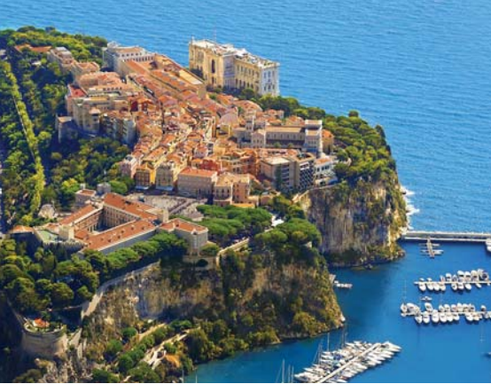
Measuring less than one square mile, glamorous and star-studded Monaco is the epitome of French Riviera chic.

PRSR STD U.S. Postage PAID Gohagan & Company