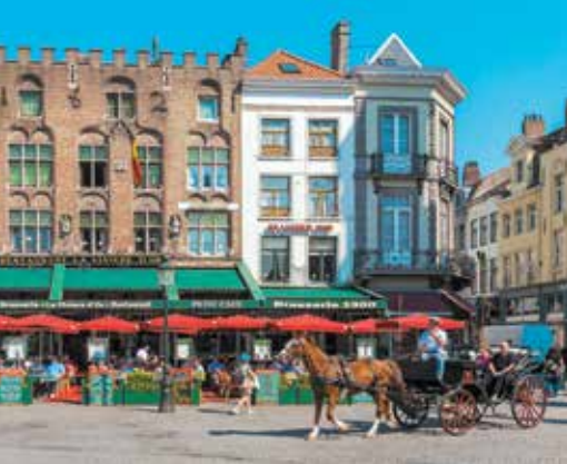
In Bruges' colorful Grote Markt, you can still enjoy a horse and carriage ride across the historic cobblestones.