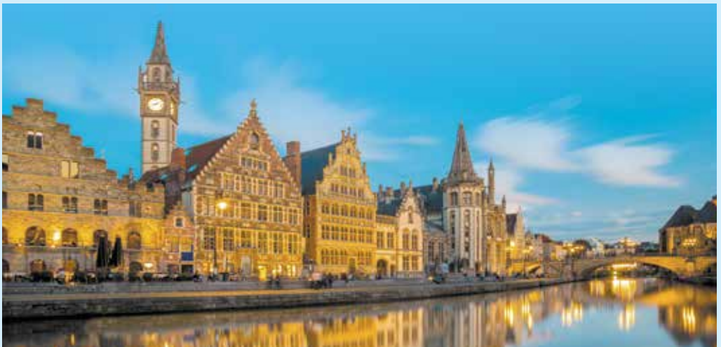
Located on the Leie River, Ghent's spectacular medieval harbor, Grassei, is celebrated for the intricate and beautifully preserved façades of its historic guildhalls and is now a protected cityscape.

The timeless, fairytale city of Bruges is a UNESCO World Heritage site of treasured architecture, virtually untouched since the 15 th -century and one of the best-preserved medieval cities in Europe. It is built around a double ring of picturesque canals connected by charming arched foot bridges and is world-renowned for its delectable, hand-crafted chocolates. Enjoy a walking tour from the Market Square to the extraordinary Gothic-style Chapel of the Holy Blood, seeing Bruges' magnificent, deftly crafted stone guildhalls and opulent churches dating back to medieval times.