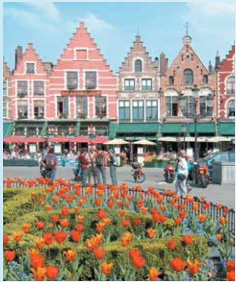
The lively, medieval Market is the principal city square and gathering point in Bruges.

The Hoofdtoren Tower on Hoorn Harbor dates back to the 16 th -century and is one of the city's last preserved fortifications.