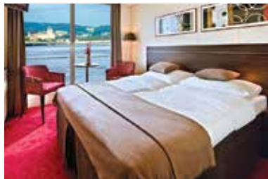
Stateroom Category 2

The English-speaking, international crew provides warm hospitality. The ship meets the highest safety standards and is one of the only European river ships to have been awarded the "Green Certificate" of environmental preservation.