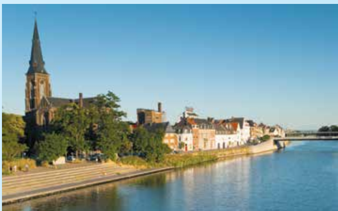
Settled in approximately 500 B.C. on the River Maas, Maastricht is widely considered to be one of the oldest towns in Holland.

Scenic Nijmegen is widely regarded as the oldest city in the Netherlands and was settled in the first century B.C. Downtown, the Valkhof Hill features an impressive ninth-century Carolingian chapel overlooking the River Waal. Among the well-preserved historic buildings are the 15 th -century town hall and Latin school, the 16 th -century, Renaissance-style Waag (weighing hall) and a series of quaint, 17 th -century houses.