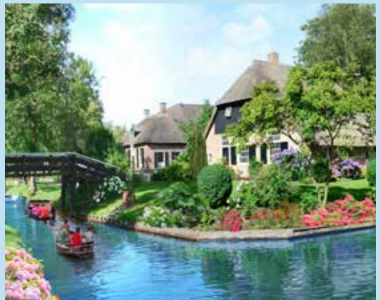
Cover photo: Cruise through Holland, where tulip blooms announce the arrival of spring.