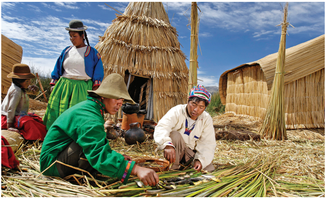
Uros Island residents weaving reeds in the traditional manner

after lunch we board a bus for Machu Picchu and our first guided visit of the stunning "Lost City of the Incas." Thanks to its small size, our group will move nimbly through the ruins and have the leisure to absorb the beauty and mystery of this haunting UNESCO World Heritage site. Midafternoon we return to Aguas Calientes and our hotel, with time at leisure before dinner together tonight. B,L,D