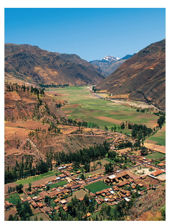
The beautiful and historic Sacred Valley