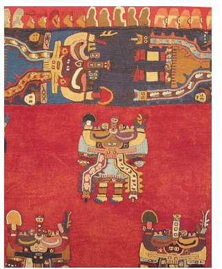
Traditional Peruvian fabric

highest navigable lakes. Up here the air is clearer, the colors sharper, and the horizon farther. By boat we visit the Floating Island of Los Uros, where the top-hatted Uros people live on "islands" made of the reeds that grow in the lake's shallows; in fact, the Uros rely on these reeds for their boats, the small huts in which they live, household items, and the handcrafts they sell to visitors. We also visit Isla Taquile, known for the high quality textiles crafted by the indigenous people who live here; sales of their textiles support the self-sustaining Taquilenos. On our