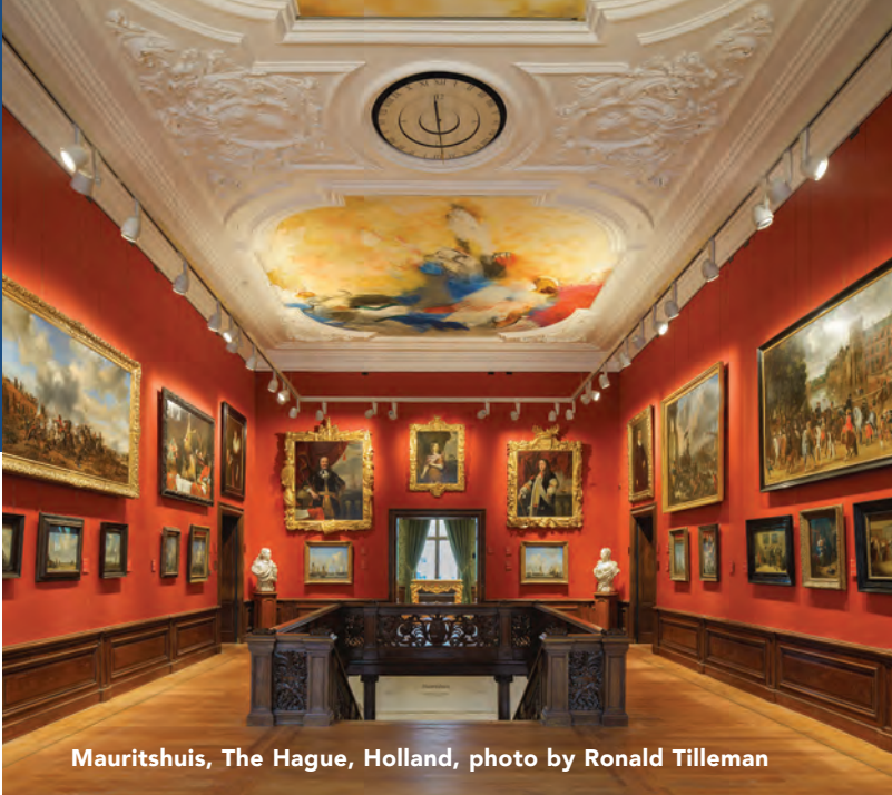
Mauritshuis, The Hague, Holland