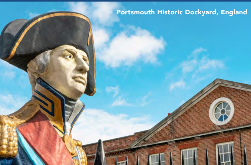
Portsmouth Historic Dockyard, England