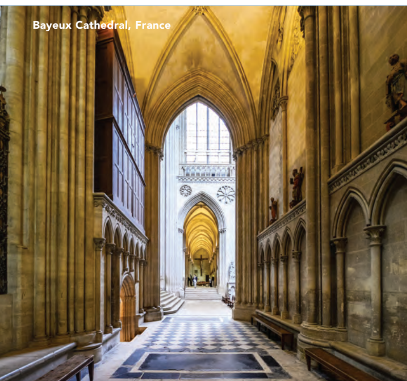
Bayeux Cathedral, France