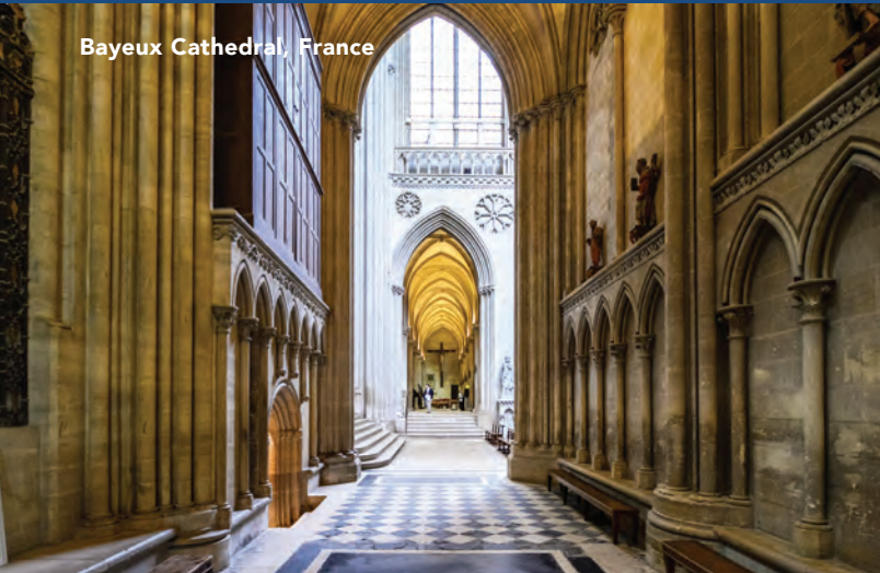
Bayeux Cathedral, France