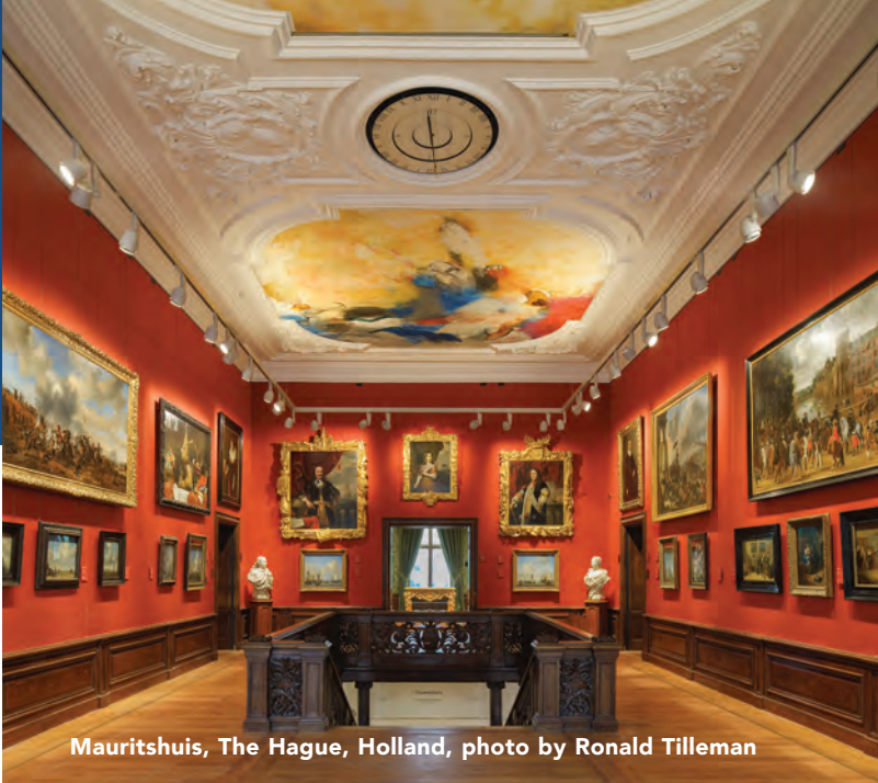
Mauritshuis, The Hague, Holland