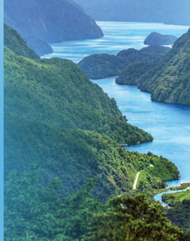
Enjoy a rare cruise of Doubtful Sound's fjord, home to fur seals and penguins.

Enjoy a guided tour of the gardens and fernery built to showcase the silver leaf fern in the 1907 New Zealand International Exhibition. See the prominent Cathedral Square, the heart of Christchurch.