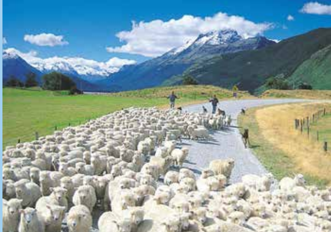
glacier-carved fiords and look for dolphins, Experience the important tradition of sheep farming in New Zealand, home to over 27 million sheep, a ratio of six sheep to every person.

Dunedin Railway Station, one of the most photographed railway stations in the world. Tour historic Olveston, the philanthropic Theomin family’s English country house. New Zealand’s only castle, Larnach (1871), was designed in Scotland then built atop a spectacular hill overlooking Otago Harbor. Enjoy a walk through its period rooms and magnificent, award-winning gardens.