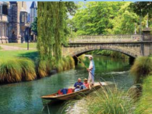
Punting on the Avon River in Christchurch is a testament to its long-standing British history.

the best way to view the rare flora and fauna of this incredibly biodiverse South Island. See impressive Mitre Peak, arguably one of the most photographed mountains in the country. Look for fur seals, dusky dolphins, Hector’s dolphins, the distinctive yellow crests of Fiordland penguins and the iconic, pear-shaped flightless kiwis.