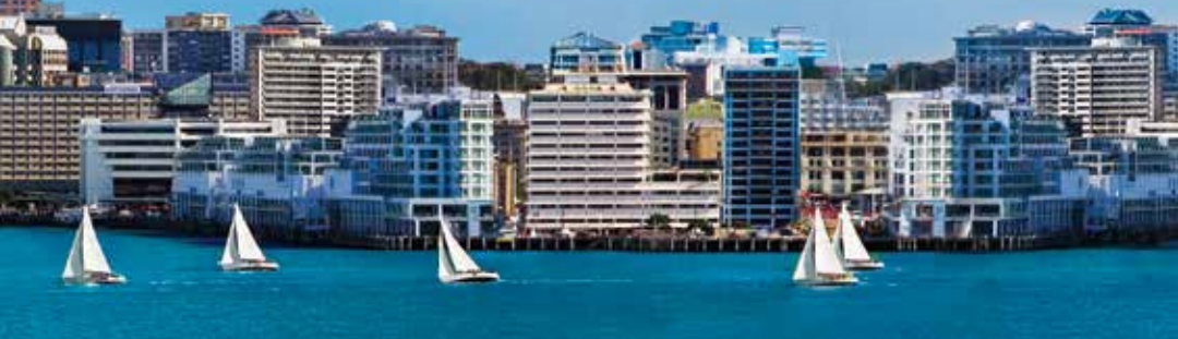
Photo this page: Explore Auckland's magnificent Waitemata Harbor, defined by the soaring Sky Tower, the tallest building in the Southern Hemisphere.