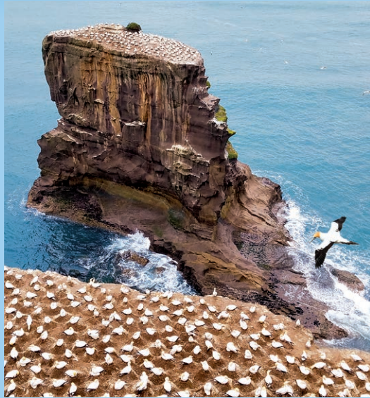
View the fascinating gannets in the Muriwai Gannet Colony, who often mate for life.

Known as "the most English city outside of England," Christchurch—named after Christ Church College at Oxford University—is the oldest established city in New Zealand. Experience this vibrant city in transition, where the restoration of Victorian architecture recaptures the provincial charm of Britain as a renaissance of new structures emerges along the Avon River. Visit the New Zealand Heritage site of Mona Vale. See the late-19 th -century homestead designed by J.C. Maddison, responsible for the English-inspired architecture in Christchurch.