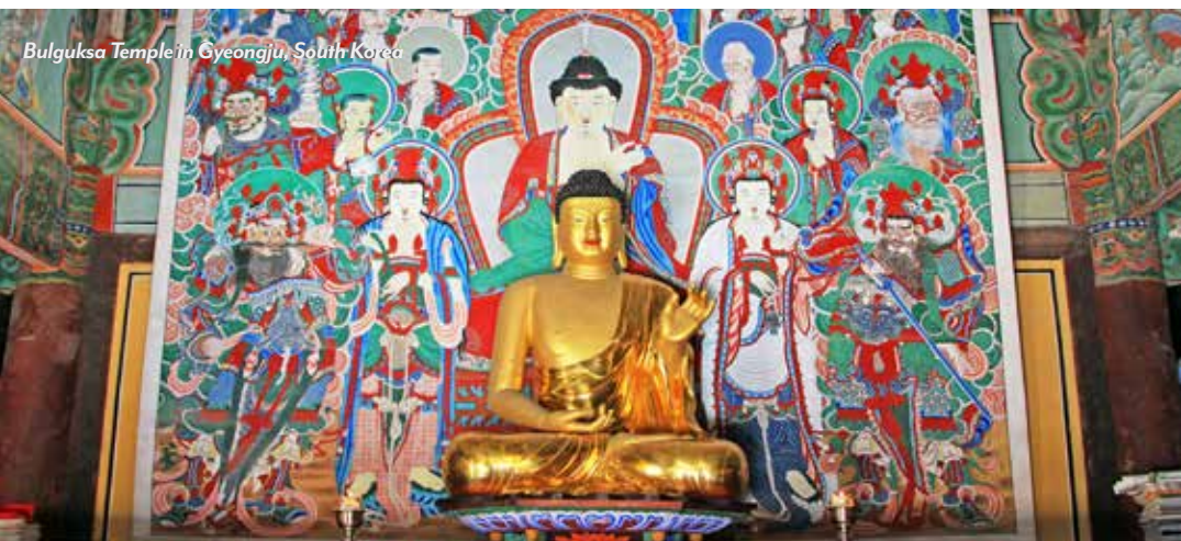
Bulguksa Temple in Gyeongju, South Korea

Drive to the solemn Hiroshima Peace Memorial Park in central Hiroshima—marking the spot where on August 6, 1945, the first atomic bomb used in war left only structural remnants of Hiroshima's Genbaku Dome—and visit the Peace Memorial Museum. Call at the island of Miyajima (Shrine Island) to tour the sixth-century Itsukushima Shrine. The shrine's impressive Great Torii Gate—appears to float on water during high tide. Attend the Captain's Welcome Reception on board the ship. (B,L,R,D)