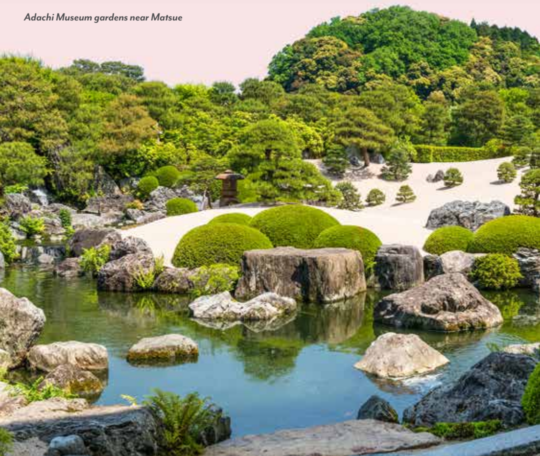
Adachi Museum gardens near Matsue