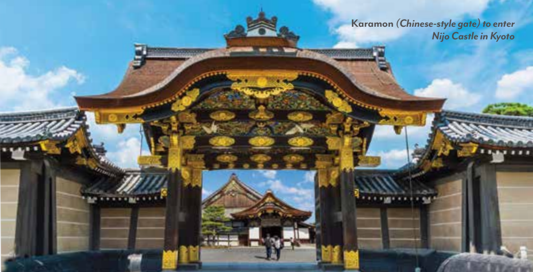
Karamon (Chinese-style gate) to enter Nijo Castle in Kyoto