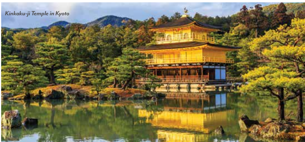
Kinkaku-ji Temple in Kyoto

After breakfast, disembark the ship and continue on the Osaka and Nara Post-Program Option or transfer to the airport for your return flight home. (B)