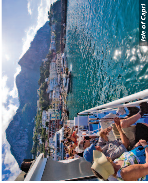
Isle of Capri