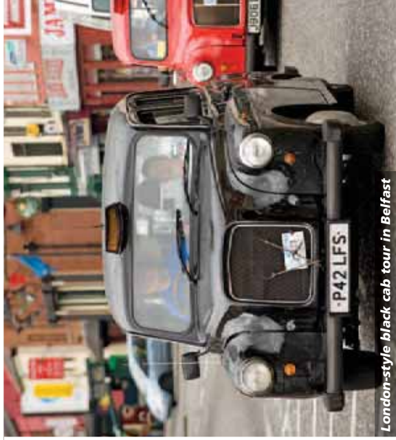
London-style black cab tour in Belfast