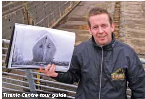
Titanic Centre tour guide