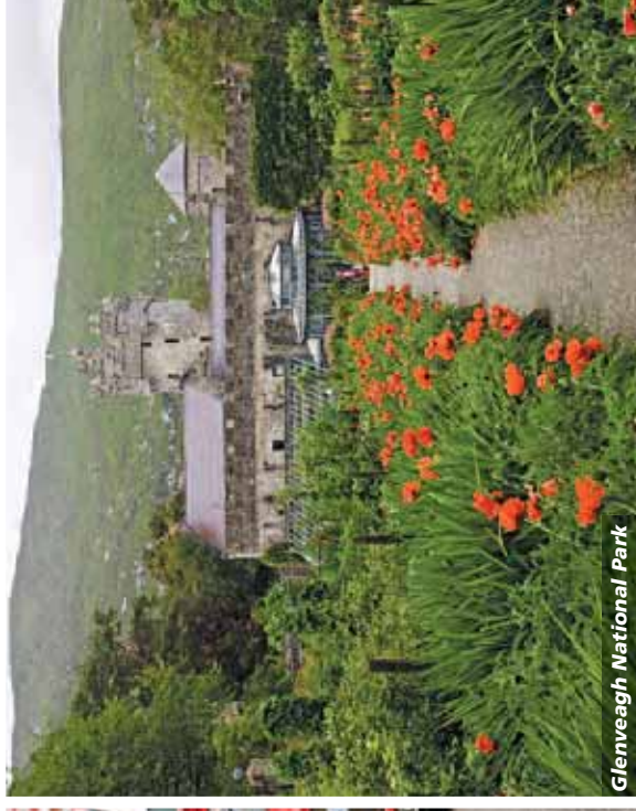
Glenveagh National Park