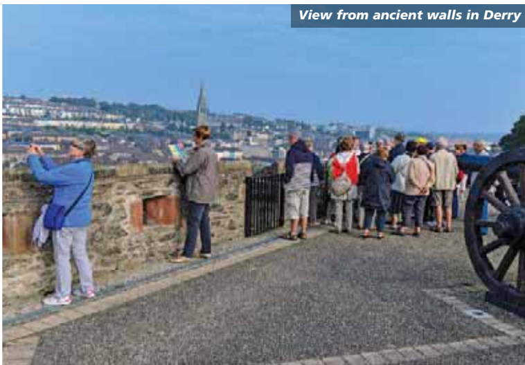
View from ancient walls in Derry