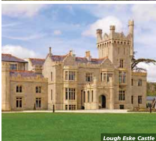
Lough Eske Castle