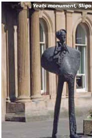
Yeats monument, Sligo