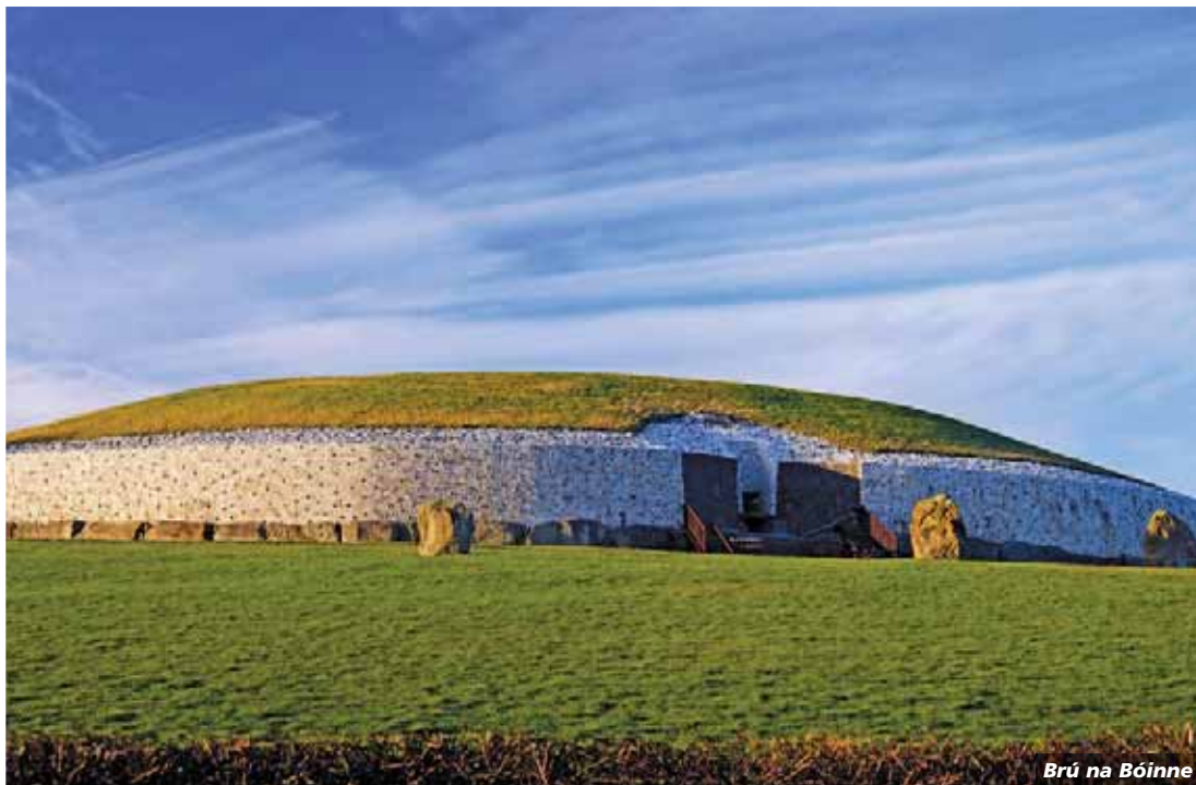
Brú na Bóinne