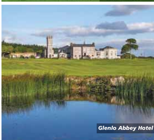
Glenlo Abbey Hotel