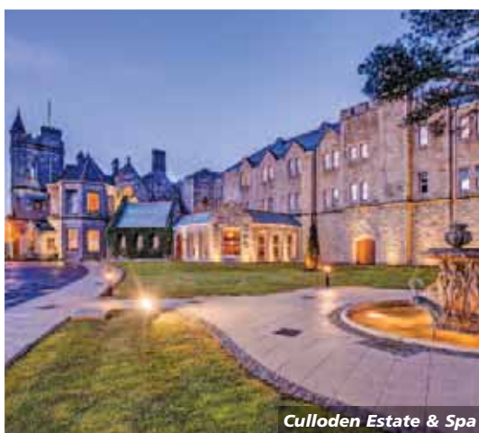
Culloden Estate & Spa

🍷 Elective experiences available at an additional cost