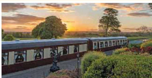
Historic train carriages at the Pullman Restaurant