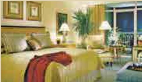
FOUR SEASONS HOTEL CAIRO AT NILE PLAZA | CAIRO