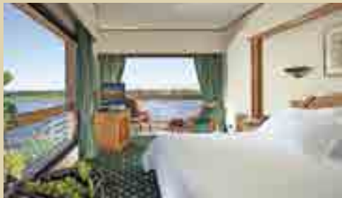
SONESTA ST. GEORGE HOTEL LUXOR | LUXOR