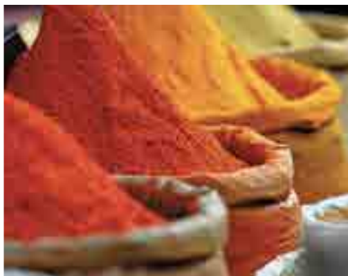
Top: The Sphinx and pyramids of Giza | Left: Cairo | Above: Spices in Khan el Khalili bazaar, Cairo

In the Solar Boat Museum, see a cedar vessel thought to be over 4,500 years old, intended as transportation for a pharaoh in the afterlife.