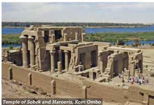
Temple of Sobek and Haroeris, Kom Ombo