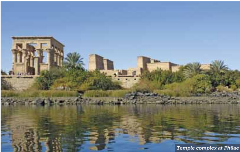
Temple complex at Philae