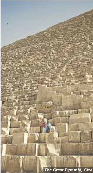
The Great Pyramid, Giza