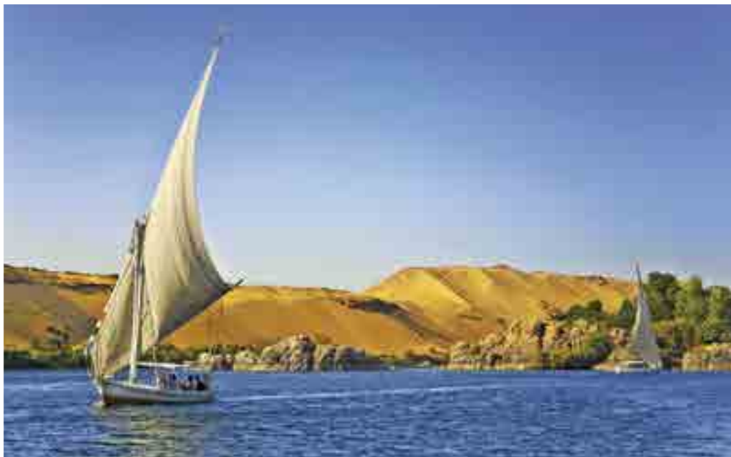
Feluccas on the Nile