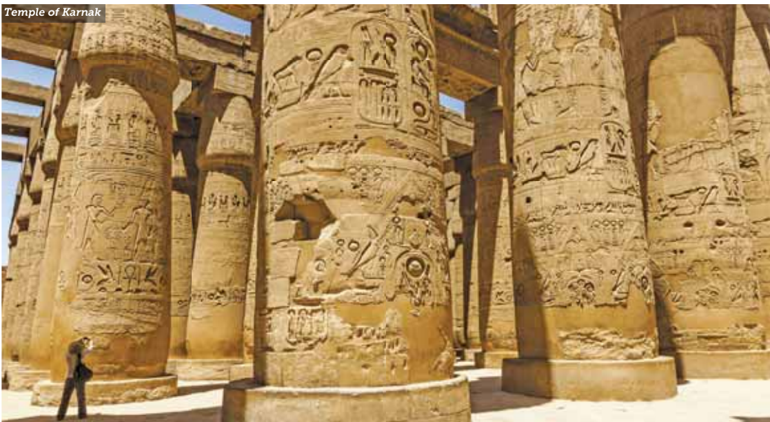
Temple of Karnak