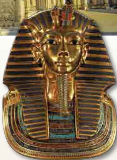
Top: Mosque of Mohammed Ali, Cairo | Above: Burial mask of Tutankhamen

Discovery: The Pyramids of Giza. View the