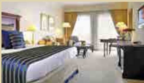
INTERCONTINENTAL CITYSTARS CAIRO | CAIRO