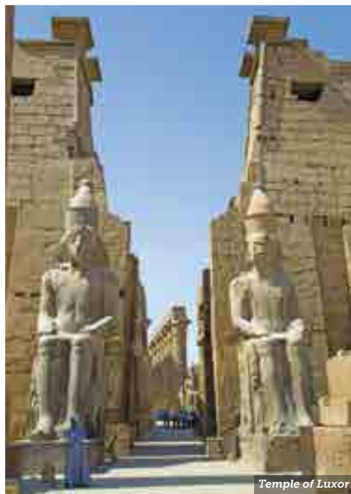
Temple of Luxor