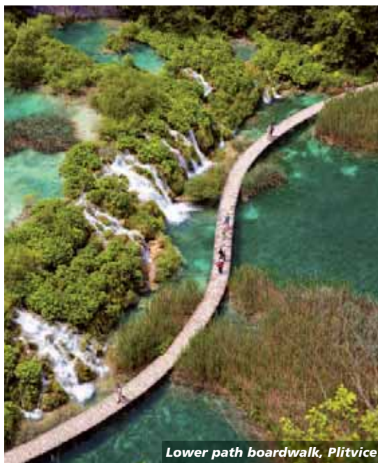
Lower path boardwalk, Plitvice

Sixteen opalescent lakes cascade from one to the next in a dramatic series of waterfalls. Miles of trails and wooden footbridges wind over, around, behind and even through the falls, immersing you in the verdant beauty of the natural wonders of this park. The constantly changing hues of the lakes — azure, brilliant green, deep blue and sometimes gray — are created by the angle of sunlight and a unique interaction between water, limestone and plant life. The travertine barriers that create the waterfalls are continually reforming, so the landscape is ever-changing. The lakes descend roughly 425 feet over five miles before flowing into the Korana River. Situated amid dense forests of beech, fir, spruce and white pine, the 115 square miles of park offers sanctuary to many animals, including black storks, endangered European brown bears and rare lynxes.