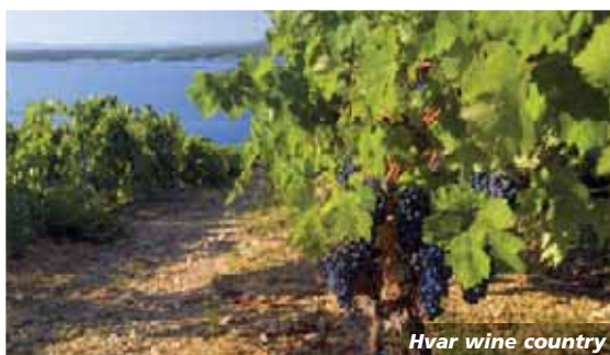
Hvar wine country