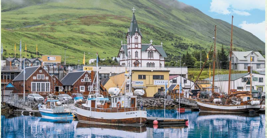
The picturesque coastal town of Húsavík is claimed locally to have been the first settlement in Iceland, reached by a Swedish Viking in A.D. 870, four years before Norwegian Ingólfur Arnarson arrived in what is now Reykjavik.

Enjoy a full-day scenic excursion along Iceland's stunning east coast from Djúpivogur to Jökulsárlón glacier lagoon.