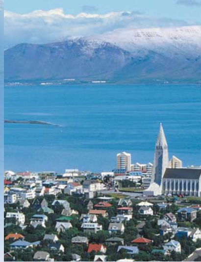
The largest city in Iceland, charming Reykjavik has been a major port for centuries until becoming the capital of a new nation in 1918 and of an independent Iceland nearly 100 years later.

UNESCO World Heritage Site - - - - - Cruise Itinerary ✈ Air Routing ... Land Routing