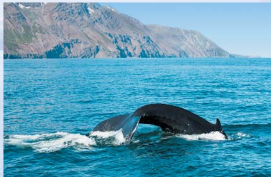
Wildlife-rich Skjálfandi Bay is an ideal place to look for diverse marine life such as the protected humpback whale.

Disembark and transfer to the airport for your return flight to the U.S.