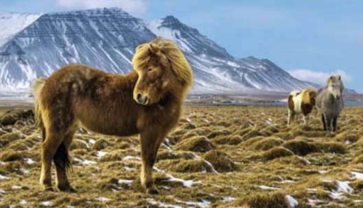
Brought from Norway by the Vikings, the pure-bred Icelandic horse is known for its strong, thick mane and tail.