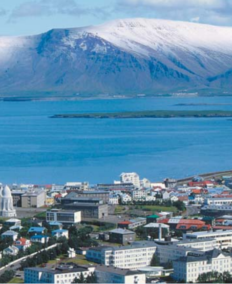
Reykjavík was a simple fishing village and trading post of self-governing Iceland under the Danish king in 1000. It became a city thirty years later.