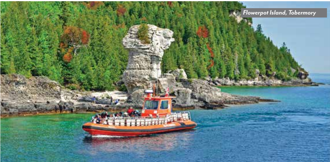
Flowerpot Island, Tobermory