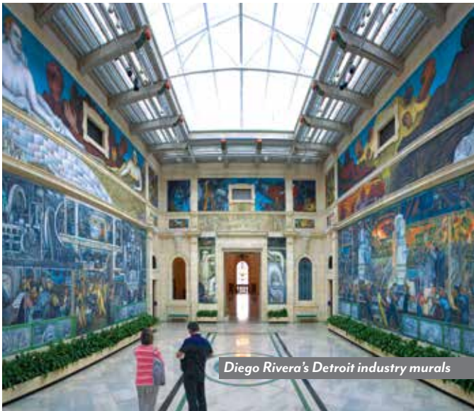
Diego Rivera's Detroit industry murals

This morning, transit the Soo Locks from Lake Huron to Lake Superior and back.