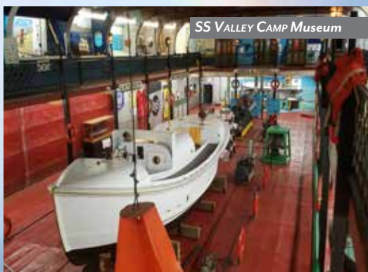
SS VALLEY CAMP Museum