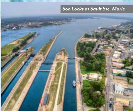
Soo Locks at Sault Ste. Marie

In the heart of North America lies the world's largest reservoir of fresh water, carved by glaciers 10,000 years ago. Surrounded by 11,000 miles of spectacularly sculpted shoreline, the five Great Lakes boast powerful natural wonders, historical maritime landmarks, and some of the greatest engineering feats of the 19 th century. Our tour offers a glimpse of life on the Great Lakes over the last two centuries as we visit the nearly 200-year-old Welland Canal that connects Lake Erie with Lake Ontario and the mighty Soo Locks—one located in Sault Ste. Marie in Ontario, Canada, and the other in a city by the same name in Michigan. Learn more about this fascinating maritime history at the SS VALLEY CAMP Museum, housed in a 1917 lake freighter, where two lifeboats from the famous EDMUND FITZGERALD shipwreck are on display.