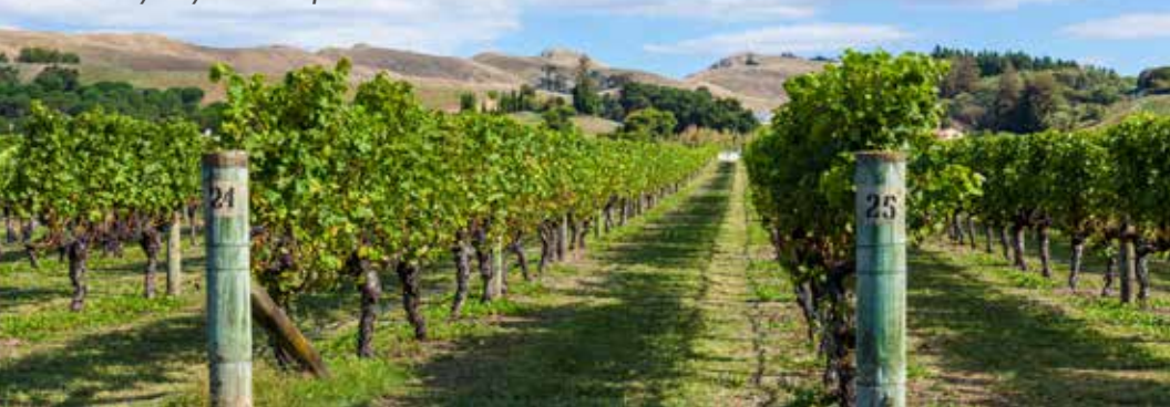
Hawke's Bay vineyard near Napier

Spend your final day in New Zealand in the storied city Christchurch for a tour that showcases the highlights—including the Mona Vale Gardens and the Canterbury Earthquake Memorial. Enjoy lunch before returning to your home city. (B,L)