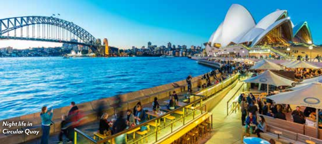
Night life in Circular Quay